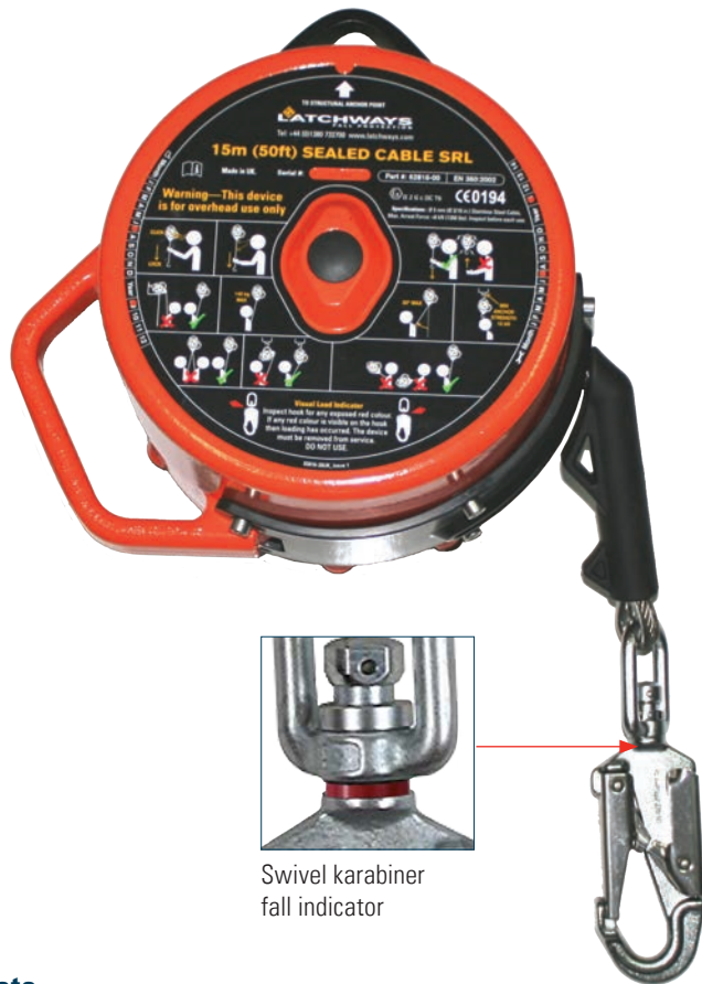
Swivel karabiner fall indicator