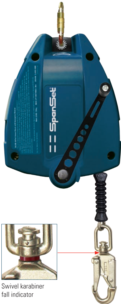
Swivel karabiner fall indicator

These fall arrest blocks with recovery adds a recovery/rescue function to the lightweight Saverlines, and are the lightest recovery blocks in their class, offering exceptional portability and also significantly safer and easier installation.