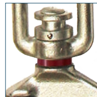
Swivel karabiner fall indicator