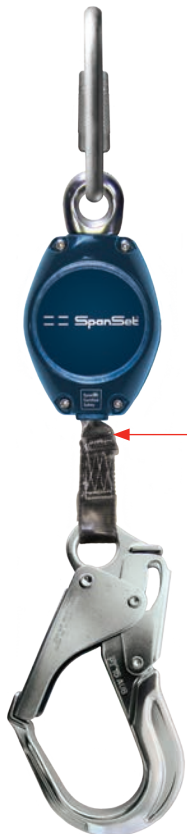
Saverline SVLB-2H3 2m Fall Arrest Block with scaffold hook