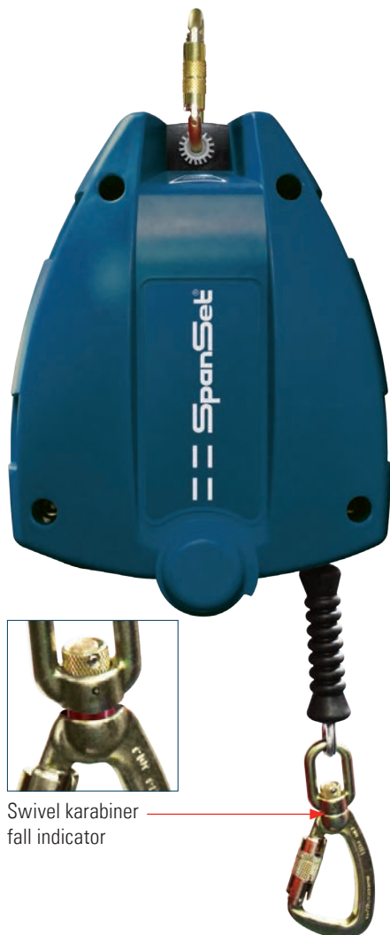
Swivel karabiner fall indicator