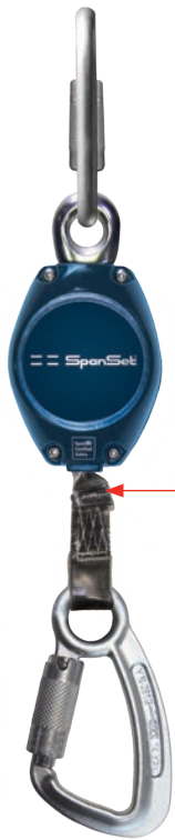
Saverline SVLB-2 2m Fall Arrest Block