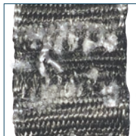
Webbing tear away fall indicator